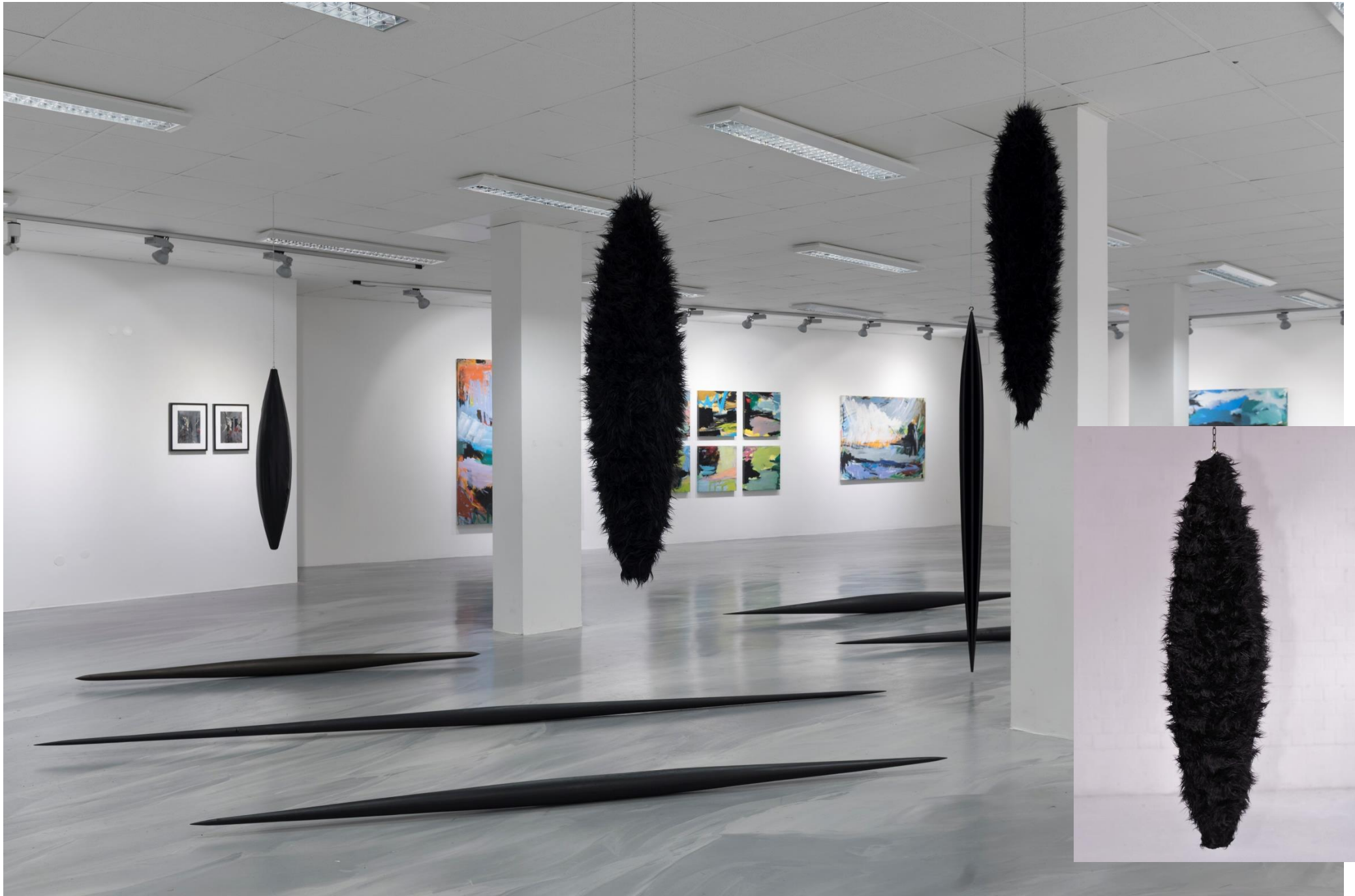
Hanging wooden construction made of hardboard, coated with woven fur, 100cm-120cm und Ø25cm, 2018