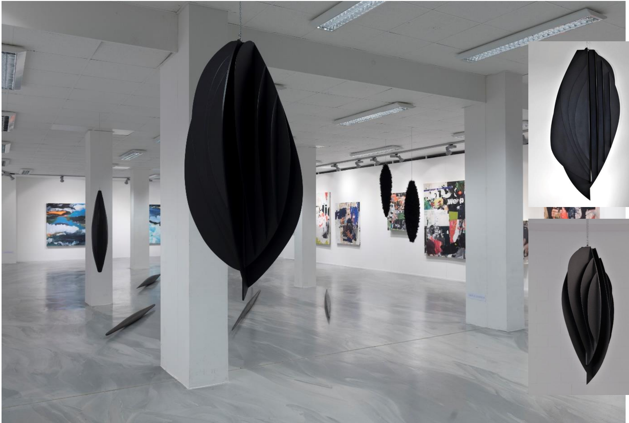
Black lacquered plywood, glued into each other, 130cm und Ø65cm, 2018