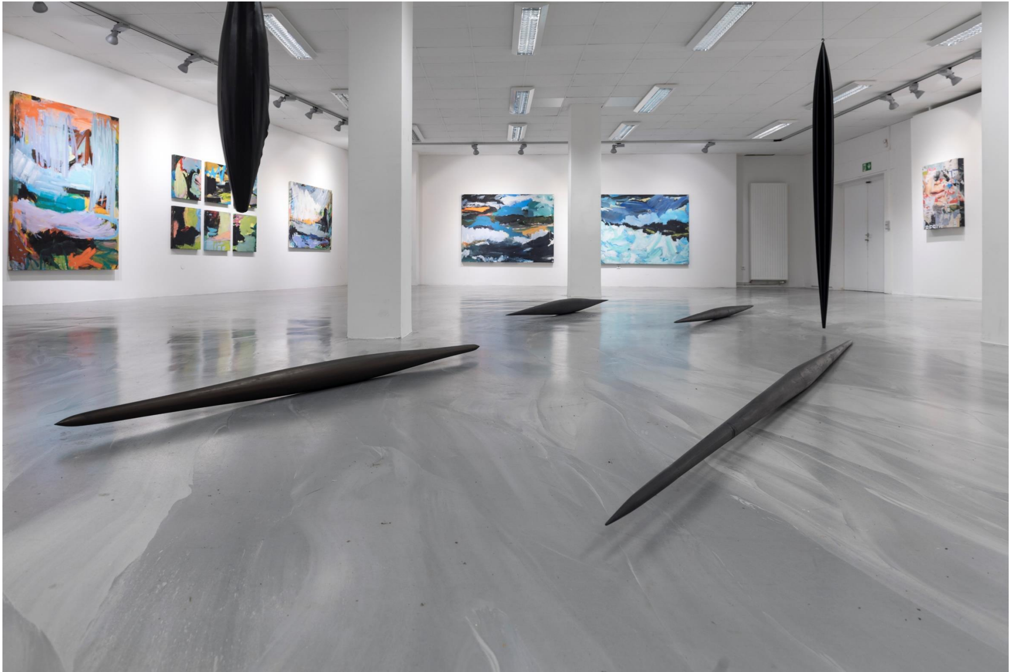
Turned spruce wood, black glazed, 280cm – 420 cm, 2018